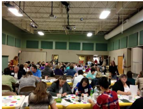
Staff wrote one word describing Community Action on a puzzle pieces and decorated them.

NEK-CAP, Inc. is committed to our mission of providing comprehensive education and social services to low-income community members through collaborative partnerships focused on promoting family development, empowerment, and economic security.